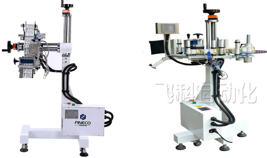
TOP/Side/Bottom Labeler for production line